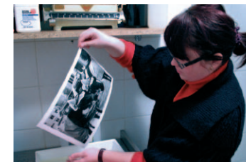
Both digital and analog photo techniques are practiced